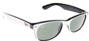
WAYFARER RB2132 770

Frame : White with black insides Lens : Crystal green