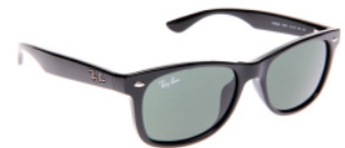
RJ9052S 100/71 Frame : Black Lens : Crystal green Our Price £60.00