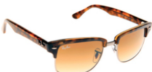
RB4190 878/51 Frame : Stainless steel & Havana brown Lens : Graduated crystal brown RRP £130.00 Our Price £114.40