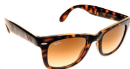
FOLDING WAYFARER RB4105 710/51

Frame : Light tortoise shell Lens : Graduated brown