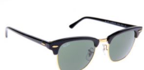
Clubmaster RB3016 W0365

Frame : Black with gold bridge Lens : Crystal green