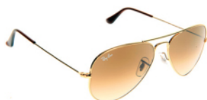
AVIATOR RB3025 001/51

Frame : Gold with brown ear socks Lens : Graduated brown