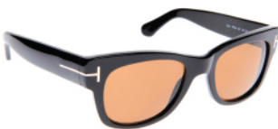
CARY FT0058 085 RRP £213.00 Frame : Black with gold hinge Lens : Brown Our Price £174.66