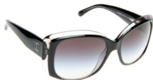
CH5227H 12993C Our Price Frame : Black Lens : Graduated grey £180.00