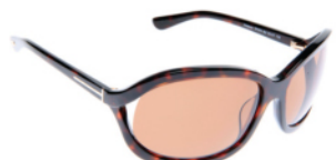
VIVIANNE FT0278 52J RRP £240.00 Frame : Dark Havana Lens : Brown Our Price £196.80