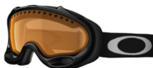
A FRAME 01-947