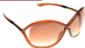
WHITNEY FT0009 692 RRP £229.00 Frame : Deep crystal brown with gold hinge Lens : Graduated brown Our Price £187.78