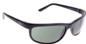
PREDATOR 2 RB2027 W1847