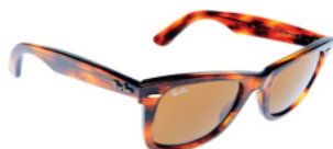
WAYFARER RB2140 954

Frame : Bright tortoise shell Lens : Brown