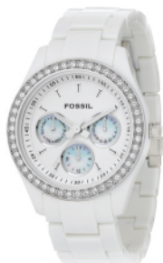
ES1967 Chronograph White dial with white polycarbonate case and bracelet RRP £85.00 Our Price £71.40