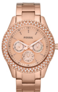
ES3003 Chronograph Rose dial with rose gold plated stainless steel case and strap RRP £125.00 Our Price £105.00