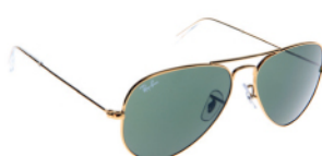
AVIATOR RB3025 L0205