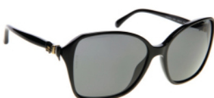
CH5205 C8883F 58 Our Price Frame : Silky black Lens : Smoke £160.00