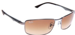
RB3498 004/13 Frame : Gunmetal Lens : Graduated brown RRP £120.00 Our Price £105.60