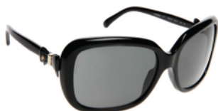
CH5171 C8883F Our Price Frame : Black Lens : Grey £160.00