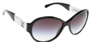
CH5229Q 13483C 59 Our Price Frame : Black with white arms Lens : Graduated grey £195.00