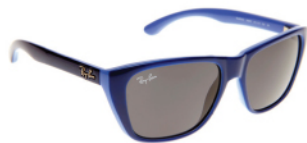
RJ9053S 180/87 Frame : Dark blue with light blue stripe Lens : Grey Our Price £50.00