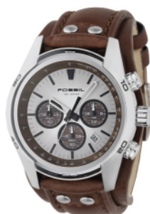
CH2565 Chronograph Silver dial with stainless steel case and brown leather strap RRP £105.00 Our Price £83.00