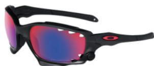
RACING JACKET OO9171-10

Frame : Matte black Lens : OO red Iridium Polarised Replacement lens : Clear