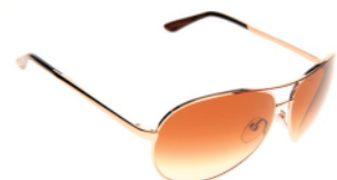
CHARLES FT0035 772 RRP £229.00 Frame : Gold Lens : Graduated gold Our Price £187.78