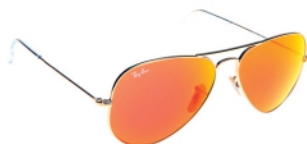
AVIATOR RB3025 112/69 Frame : Matte Gold Lens : Mirrored brown/orange RRP £135.00 Our Price £118.80