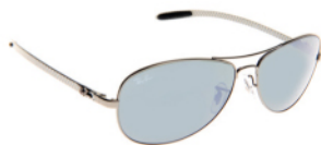
TECH RB8301 004/40 Frame : Gunmetal wire Lens : Silver mirror RRP £140.00 Our Price £123.20