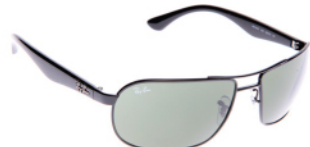
RB3492 002 Frame : Shiny black Lens : Green RRP £125.00 Our Price £110.00