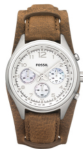
CH2795 Chronograph Silver dial with stainless steel case and brown leather strap RRP £100.00 Our Price £84.00