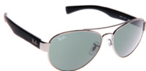
RB3491 004/71 Frame : Gunmetal frame with black arms Lens : Green RRP £100.00 Our Price £88.00