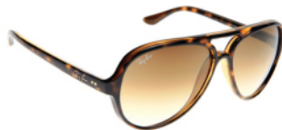
CATS RB4125 710/51 Frame : Dark tortoise shell Lens : Graduated brown RRP £125.00 Our Price £110.00