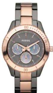
ES3030 Analogue Grey dial with rose gold plated stainless steel case and grey and rose gold stainless steel strap RRP £115.00 Our Price £96.60