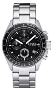
CH2600 Chronograph Black dial with stainless steel case and strap RRP £85.00 Our Price £71.40