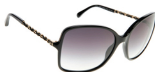
CH5210Q C5013C 57 Our Price Frame : Black and gold Lens : Graduated grey £230.00