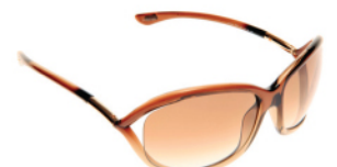
JENNIFER FT0008 38F RRP £213.00 Frame : Brown to clear Lens : Graduated Brown Our Price £174.66