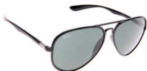
RB4180 601/71 Frame : Black Lens : Green RRP £150.00 Our Price £132.00