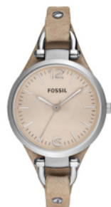
ES2830 Analogue Beige dial with stainless steel case and beige leather strap RRP £65.00 Our Price £54.60