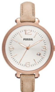
ES3133 Analogue Grey dial with rose gold plated stainless steel case and light brown leather strap RRP £105.00 Our Price £87.90