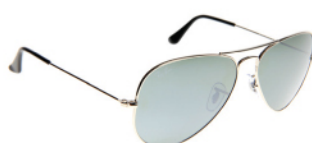
AVIATOR RB3025 W3277