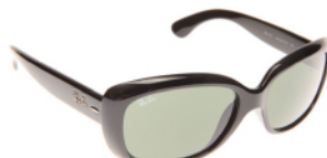
JACKIE OHH RB4101 601

Frame : Polished black Lens : Crystal green