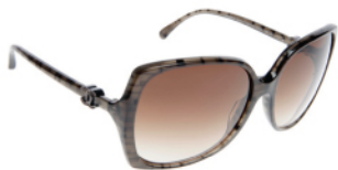
CH5216 13053B Our Price Frame : Textured brown Lens : Graduated brown £190.00