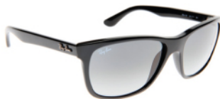
RB4181 601/9A Frame : Dark tortoise shell Lens : Crystal green RRP £140.00 Our Price £123.20