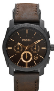
FS4656 Chronograph Black dial with carbon coated stainless steel case and brown leather strap RRP £125.00 Our Price £105.00