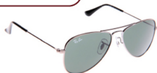
RJ9506S 200/71 Frame : Gunmetal Lens : Green Our Price £45.00