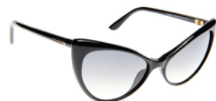
ANASTASIA FT0303 01B RRP £210.00 Frame : Black Lens : Grey Our Price £172.20